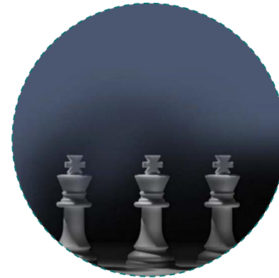
Governance & Business Models