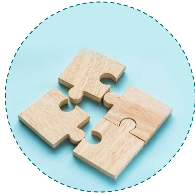
High Priority Dataset